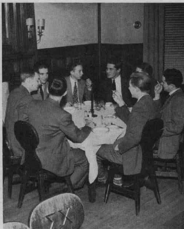
SIGS ENJOY CHATTING BETWEEN COURSES

The big school dances such as Field Day, Junior Prom, and Interfraternity Conference all appear to be coming off in the Fall; the Sigs will temporarily stop activities just before Christmas vacation with their annual Christmas Party, featuring Sonny Dunlop as "Euripedes Q. Claus."