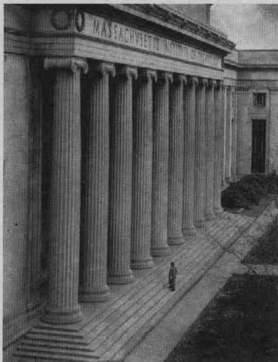
GREAT COURT VIEW OF ENTRANCE TO TECH