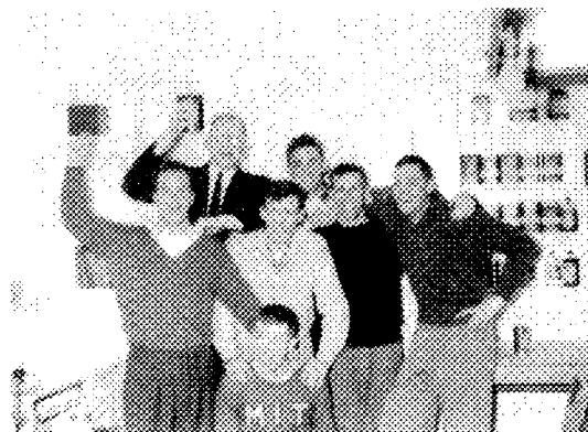
THE HOCKEY CHAMPIONS

An inactive status does not mean an inactive attitude!