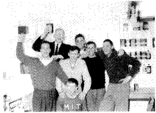
THE HOCKEY CHAMPIONS

An inactive status does not mean an inactive attitude!