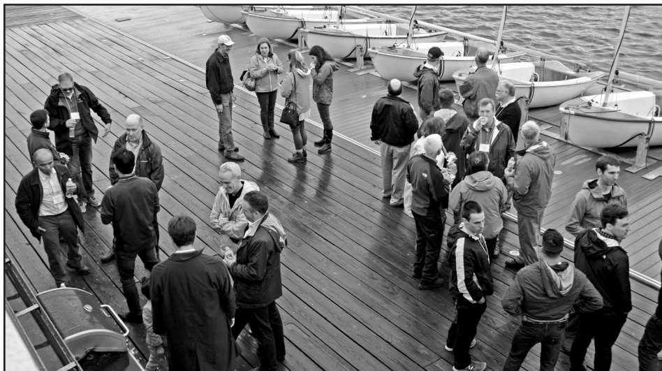
Reunion attendees enjoy a break in the rain after lunch on the MIT Sailing Pavilion.