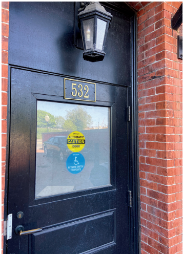
Pictured above: Our back door with the new address plaque addition