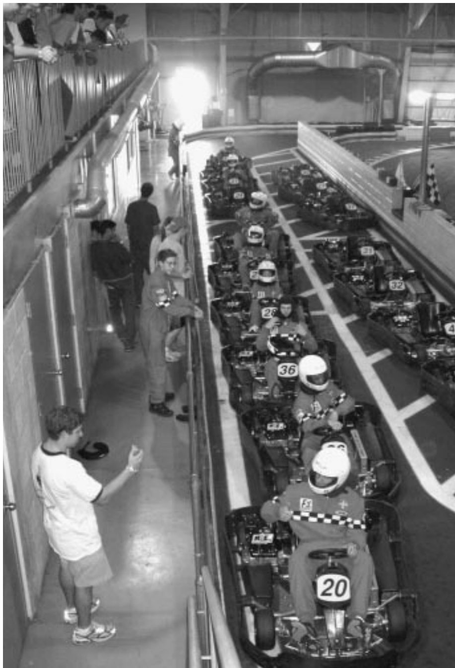
Brothers and potentials get ready to race during the Mini Grand Prix at Formula One Racing Boston.